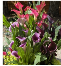
Great Color for Easter!